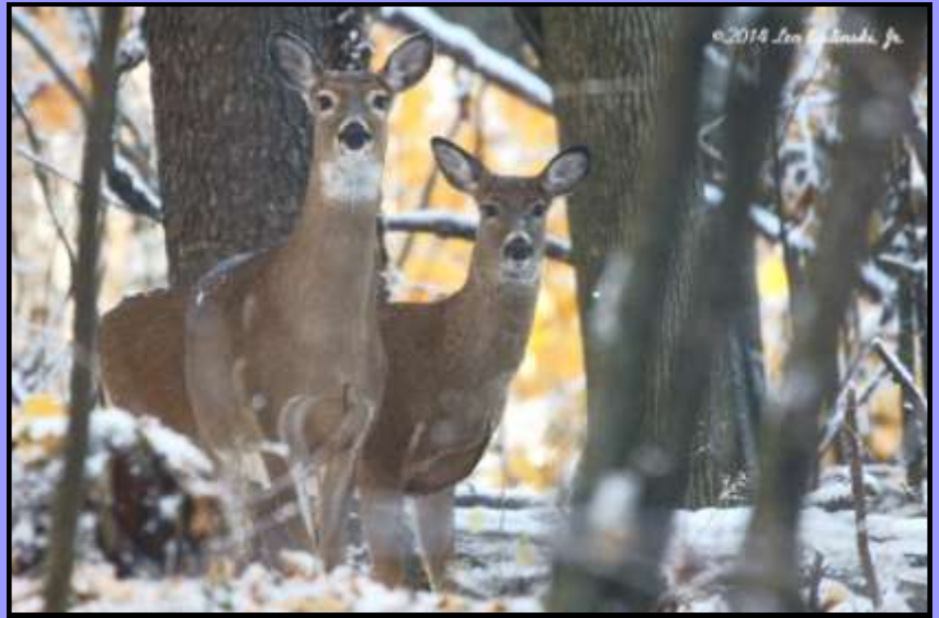
Snow Wonder

Phone: 860-567-0857 E-Mail: info@whitememorialcc.org Website: www.whitememorialcc.org