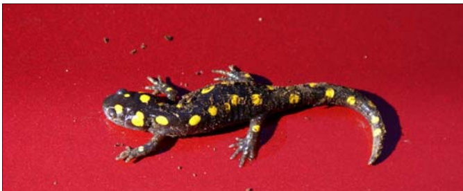
Here Spot!: Yellow Spotted Salamanders are one example of the species Fischer hopes to attract to his cover boards.

http://www.youtube.com/watch?v=lwb1lmgUK-w