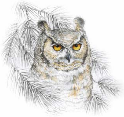
The Great Horned Owl seeks out the

Some of our terrestrial frogs like spring peepers and wood frogs can even freeze solid! Their cells have adapted so they will not be damaged by the ice crystals. In March they begin to emerge from their frozen sleep and start chorusing to find a mate — a much more reliable signal than any groundhog's shadow that spring is on its way!